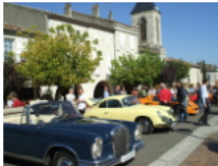
Auction of sport and collection cars.